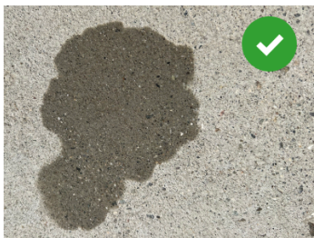
Etching NOT required